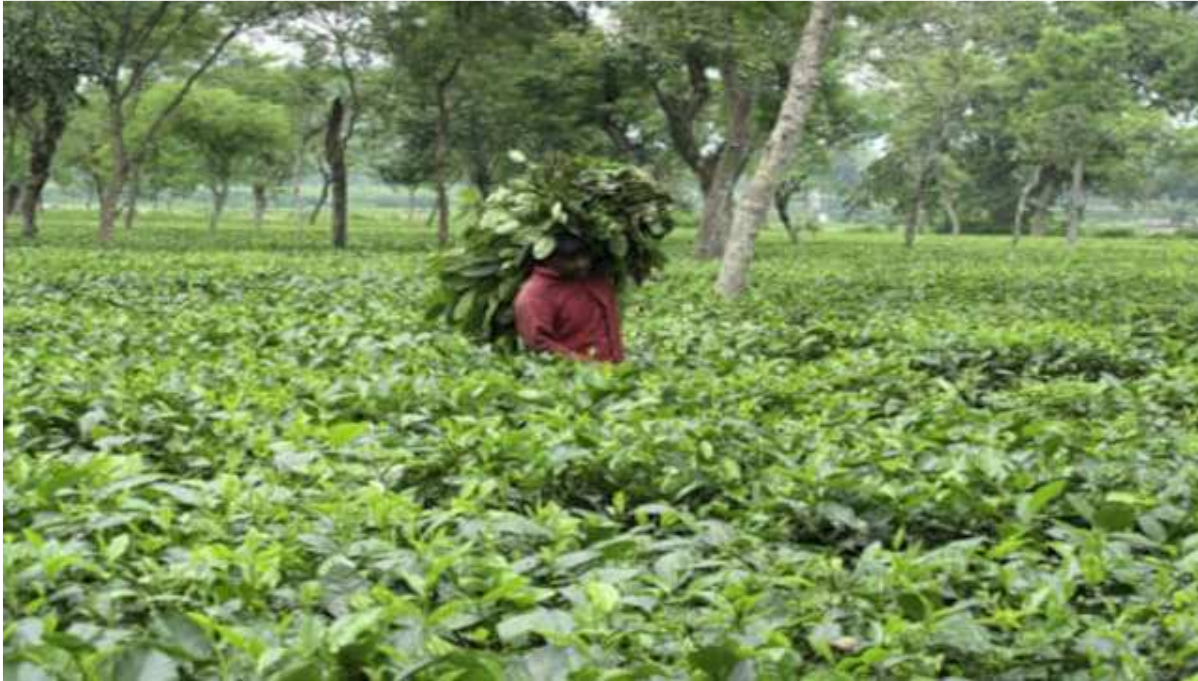
Representative image.

FP Trending September 15, 2022 19:53:49 IST