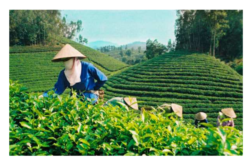
The share of tea imports from Vietnam as part of total US tea imports expands by 0.5 percentage points on year.

Vietnam is the fifth largest tea supplier to the United States, with the share of tea imports from the nation as part of total US tea imports increasing by 0.5 percentage points compared to January, 2021.